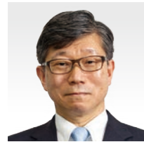
Full-time Audit & Supervisory Board Member