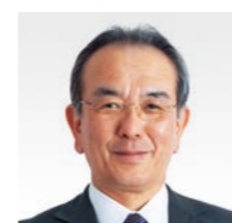
President and Representative Director