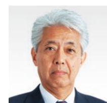
Chairman of the Board and Representative Director