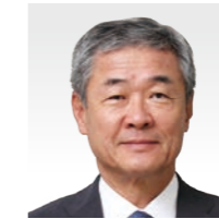
Audit & Supervisory Board Member